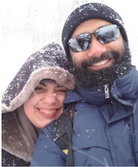
With my wife