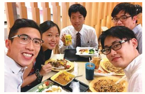
Cafeteria of the hospital with local students

Voice of the International Students 医学研究科 国際連携室だより Vol.15