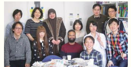
With lab members

As a part of cultural exchange, my wife and I held a small Egyptian food party with my outstanding lab members. It was an amazing day and everybody was so happy.