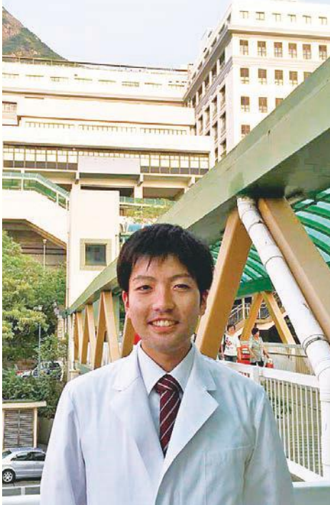
In front of the Queen Mary Hospital